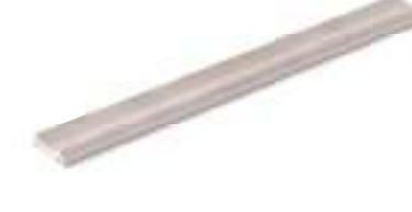
Media caña interior Inner trim