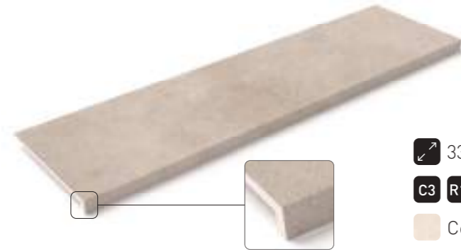
Peldaño recto · Recto step