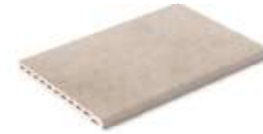
Borde Creta · Creta edge