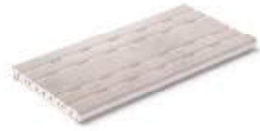
Rejilla de drenaje RJ25 · Drain grate RJ25