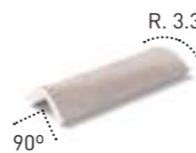
Cantonera transición exterior External transition corner