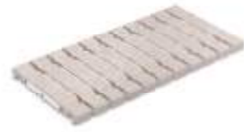
Rejilla de drenaje RJ25 FLEX · Drain grate RJ25 FLEX

Goma para rejilla 9710 incluida Grate rubber 9710 included