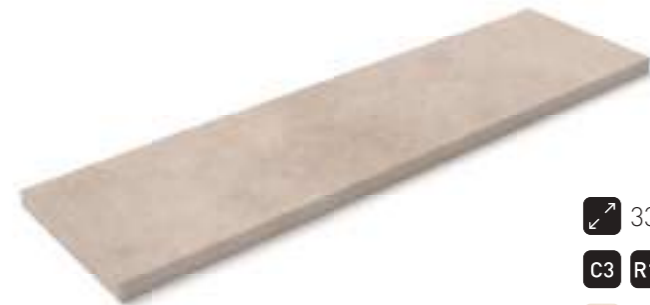
Peldaño recto tapa · Recto step corner