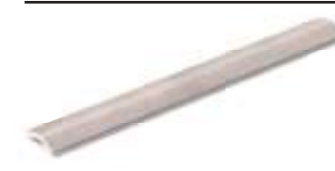
Media caña exterior Outer trim