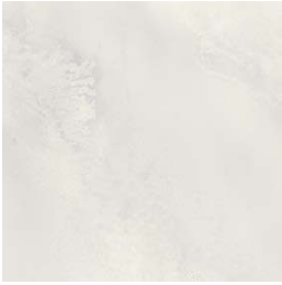
HYDRA WHITE 90 X 90 / 36" X 36" REC. SSHINE 90 X 90 / 36" X 36" REC. LAP. III