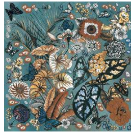
DECOR. HYDRA AQUA 90 X 90 / 36" X 36" REC. SSHINE