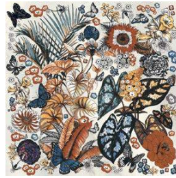
DECOR. HYDRA WHITE 90 X 90 / 36" X 36" REC. SSHINE