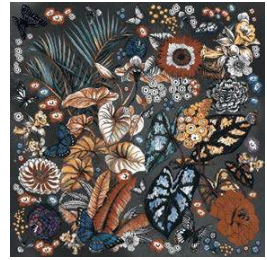
DECOR. HYDRA BLACK 90 X 90 / 36" X 36" REC. SSHINE