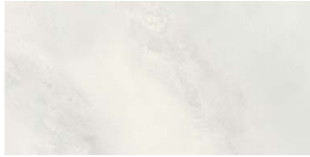
HYDRA WHITE 60 X 120 / 24" X 48" REC. SSHINE 60 X 120 / 24" X 48" REC. LAP. III