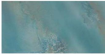
HYDRA AQUA 60 X 120 / 24" X 48" REC. SSHINE 60 X 120 / 24" X 48" REC. LAP. III