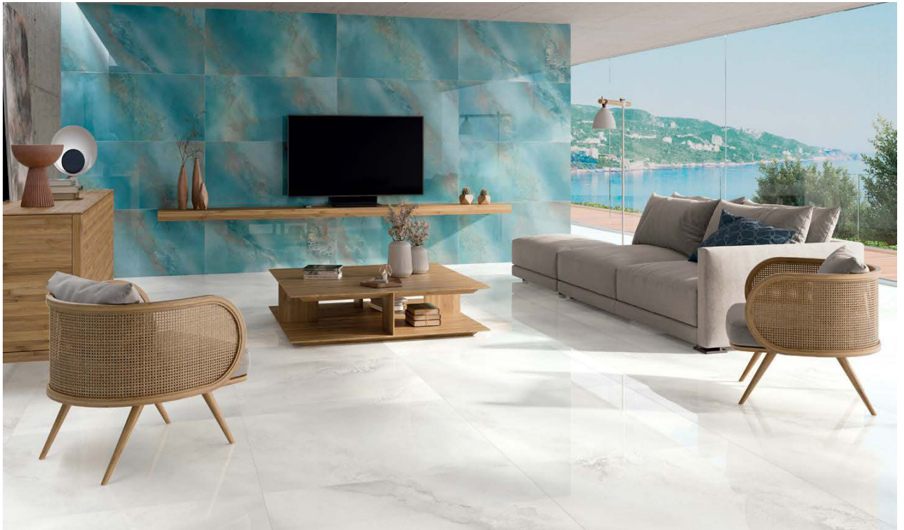
Wall Tile / Resesimiento HYDRA AQUA 90 X 120 REC. SHINE Floor Tile / Paving HYDRA WHITE 90 X 90 REC. SHINE