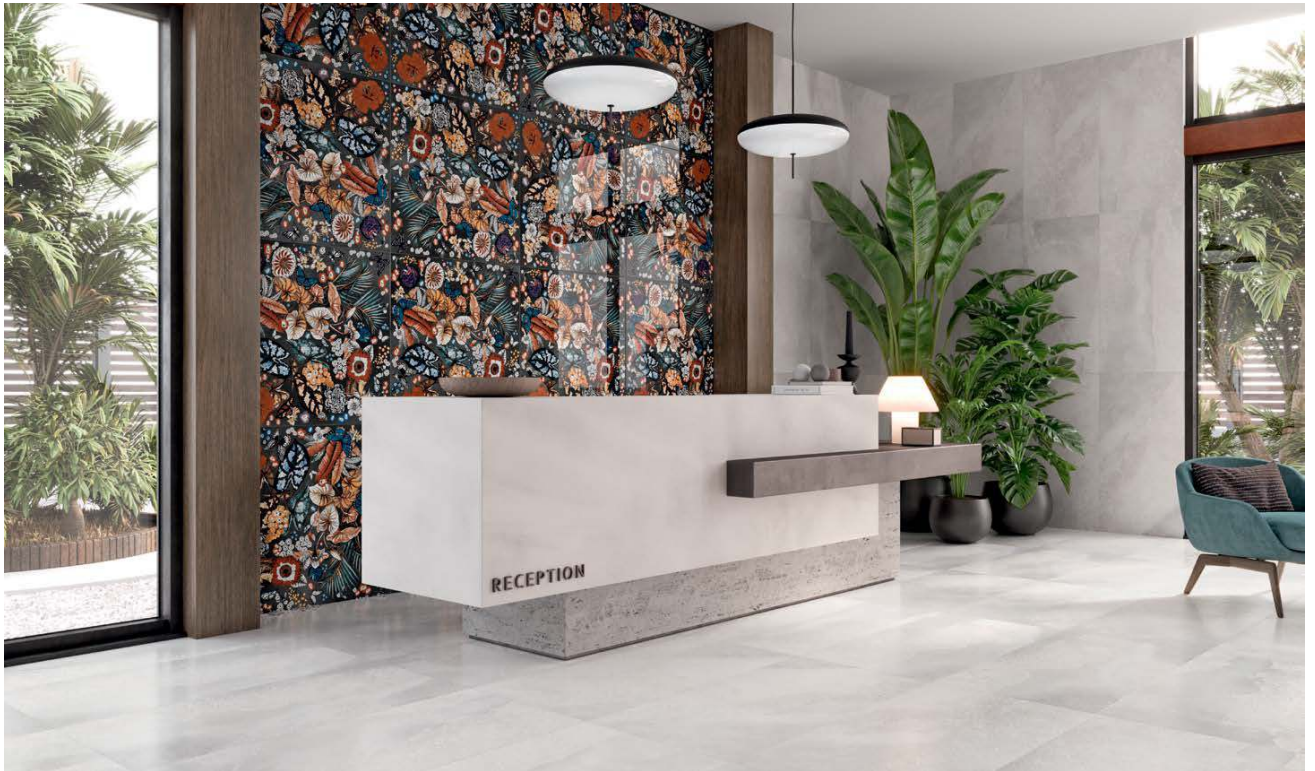
Wall Tile / Resacimiento DECOR: HYDRA BLACK 90 X 90 REC. SHINE + HYDRA WHITE 60 X 120 REC. LAP Floor Tile / Paving HYDRA WHITE 60 X 120 REC. LAP